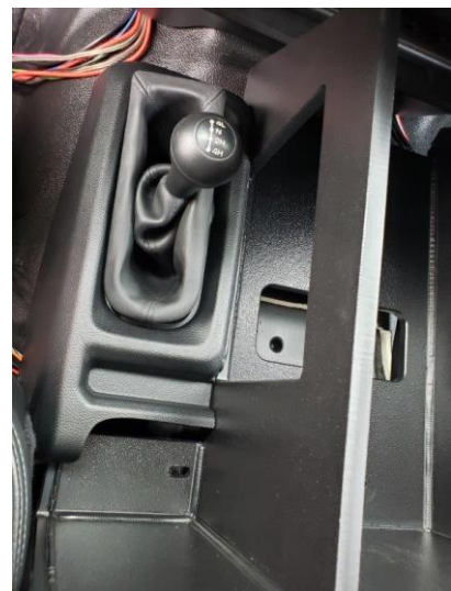
Step 6 - install console with provided bolts