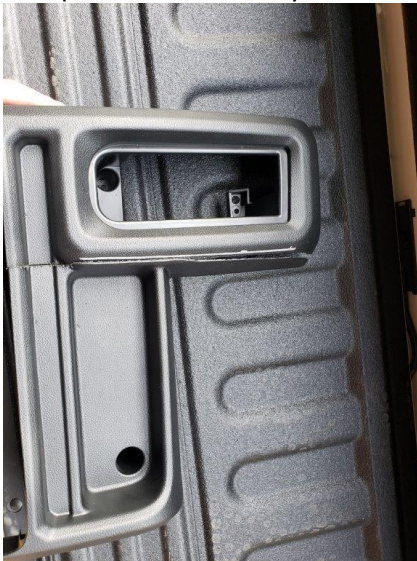
Step 3 - remove 4x4 cover