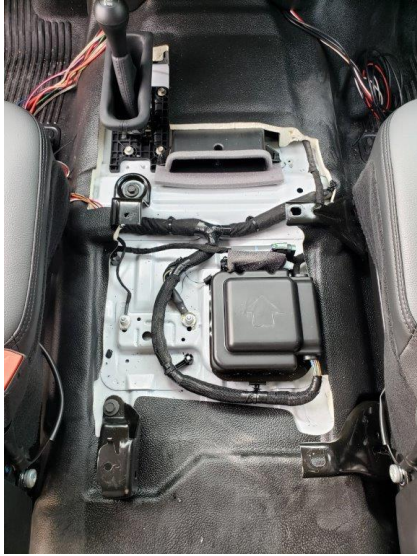
Step 1 - remove factory console