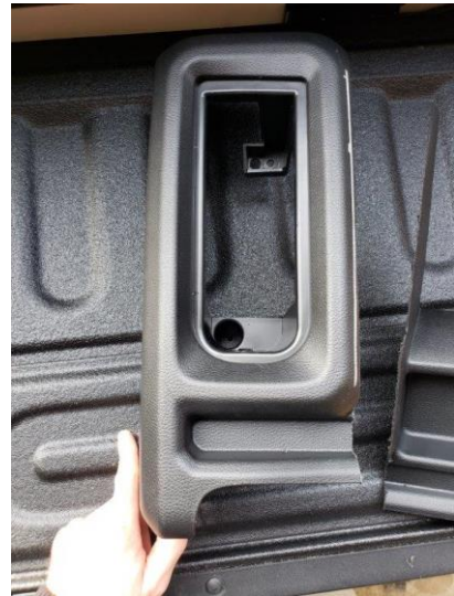
Step 4 - cut 4x4 cover